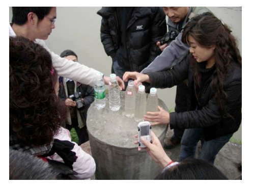
Participants collect water from the Botiao River

WWF and CURA (Chengdu Urban River Association) jointly held a River Scorecard Action, named "Love Chengdu, Love Water", on March 7, 2009. More than 20 citizens participated. They started from Chengdu's freshwater resource – Botiao river to Fu River, one of the two urban rivers of Chengdu and ended at Huanglong brook.